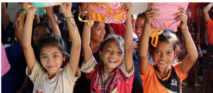
Days for Girls Hygiene kits