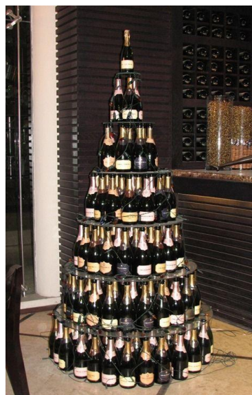
Champagne bottle tree