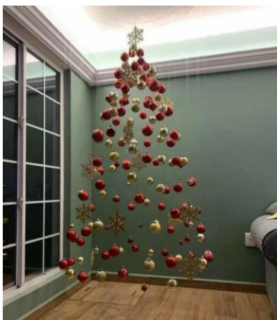
Save the environment no tree, hanging tree

The Christmas tree tradition started in Germany in the 16th century, when devout Christians would decorate trees in their homes. However, Christmas wasn't the celebration it is now. It wasn't until the Victorian period that Christmas was celebrated in a way more similar to what we do today. At that time the Christmas tree was put up and decorated late in December, usually the afternoon of Christmas Eve.