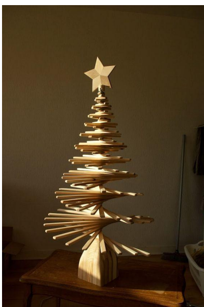
Wooden stick tree