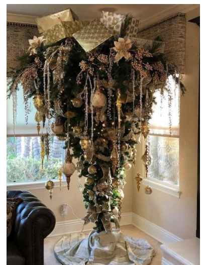
It's been an upside down year so an upside down tree